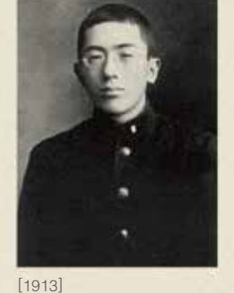
Enters the design department of Tokyo Higher Technical School